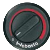
Standard control panel