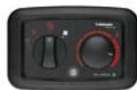
Evo multifunction control panel